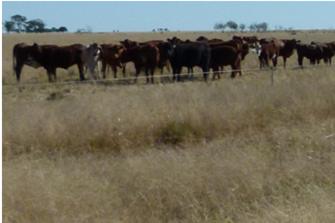
Increased pasture availability has enabled a significant increase in stocking rates

In their stock trading operations, Graham and Cathy use strategies developed by Bud Williams in the USA, and now taught by KLR Marketing in Australia. These are based on keeping the three inventories of price, available pasture and stock holding in balance. Using a 'sell-buy' process rather than a 'buy-sell' process, in the balanced inventory context, they can decide on selling and re-stocking options.