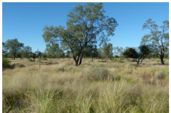
Vegetation diversity and coverage has significantly increased

The planned rotational grazing practices have given young trees and shrubs respite from literally being ‘nipped in the bud’. Independent monitoring from the beginning of the EBC Project has shown a steady increase in the number of native trees, increased ground cover and the presence of perennial grasses.