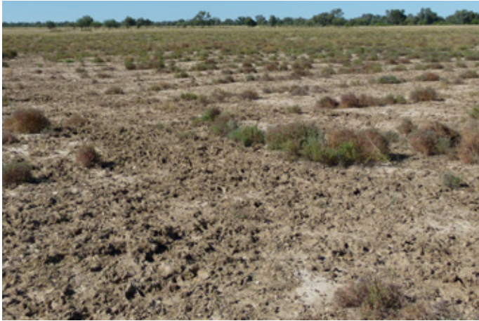
Disturbed surface and early claypan regeneration