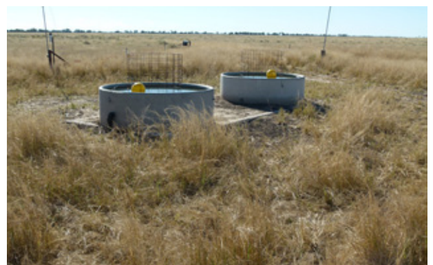
The waterpoints are the 'hub' for multiple paddocks in the wagon wheel design. They are high-use areas when accessible (top), but the pasture can recover after rest (below)