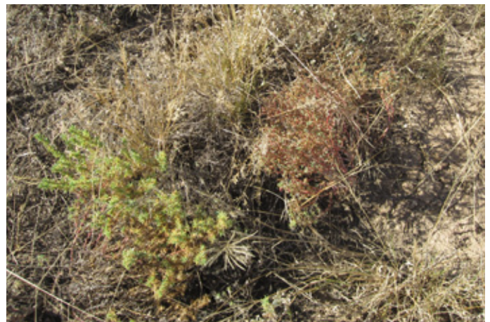
Grass seeds in disturbed claypan (top) and regeneration of early coloniser, copper burr (below)