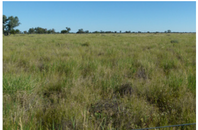
Healthy pastures have replaced the once degraded landscape