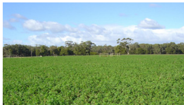
Clover Estate lucerne pastures which are interspersed with rye grass, clover and plaitain

A total of about 62 hectares of Clover Estate is irrigated and the rest is used for unirrigated grazing and cutting hay to provide feed during winter. A highly modified landscape, almost all native flora on Clover Estate has been replaced with introduced pasture species.