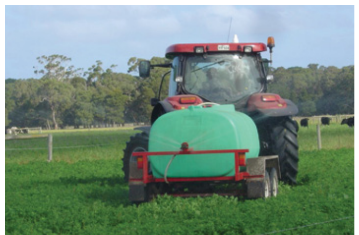
Spraying biological liquid fertiliser

"The aim was to start with the soil health, by balancing the mineral and microbial status of soil, and the subsequent benefits in forage quality and animal health would follow."