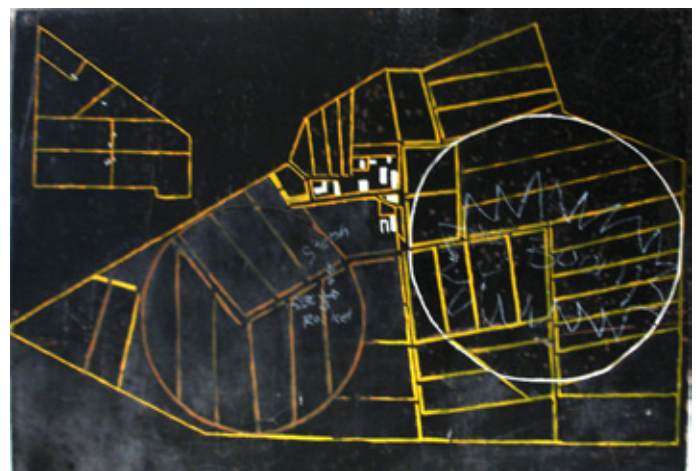
Clover Estate centre pivot irrigation layout

"Our example has inspired other farmers, particularly dairy and graziers, to adopt aspects of soil management as we have. Looking at our soil profile, black to the depth that it is, speaks for itself. Most farmers appreciate that something is different and improved on our property. We are happy to share our journey, as it appears to give confidence to other food producers to take on similar management. Less chemicals affecting the environment, with improved quality of food for consumers is a better outcome than prior to adopting biological farming system."