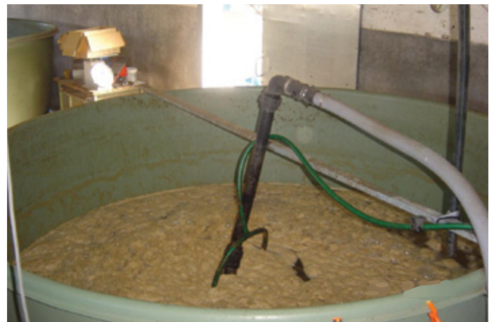
Above: Microbe brewing Top: David Clayfield with bags of soil treatment used on the property