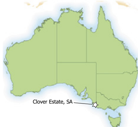
Clover Estate, SA